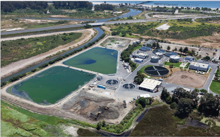
Aerial photograph, looking south toward Goleta Beach, at the start of construction. June 7, 2011.