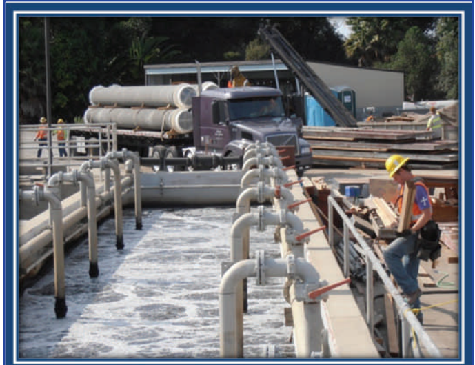
The treatment process during construction, has been maintained by District staff so effectively that the community has been unaffected by the construction project.

District staff has been working closely with the construction contractors to schedule shut downs and new equipment tie-ins so as to maintain the wastewater flow and treatment process without disrupting wastewater service to the community.