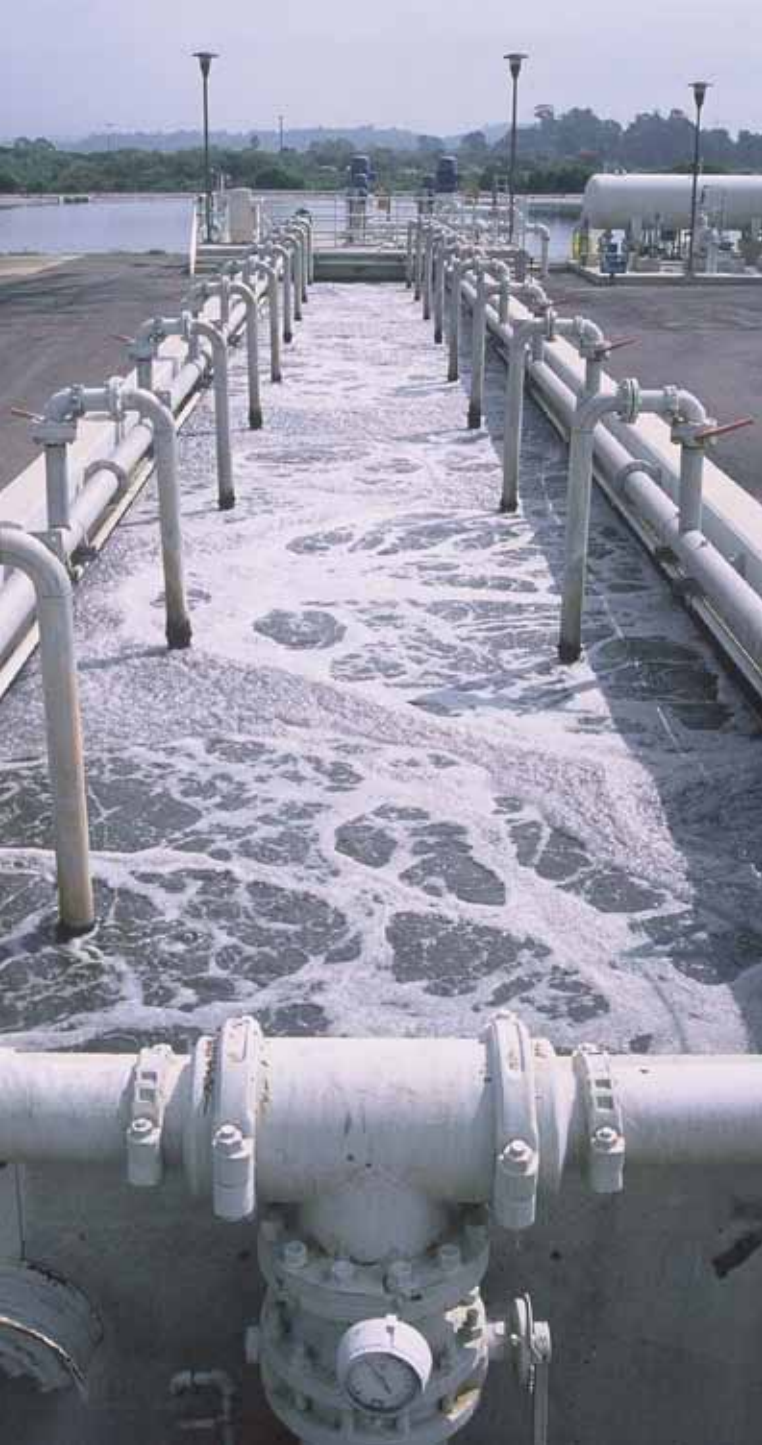
During the treatment process, air is injected to help support natural bacteria that purify wastewater.