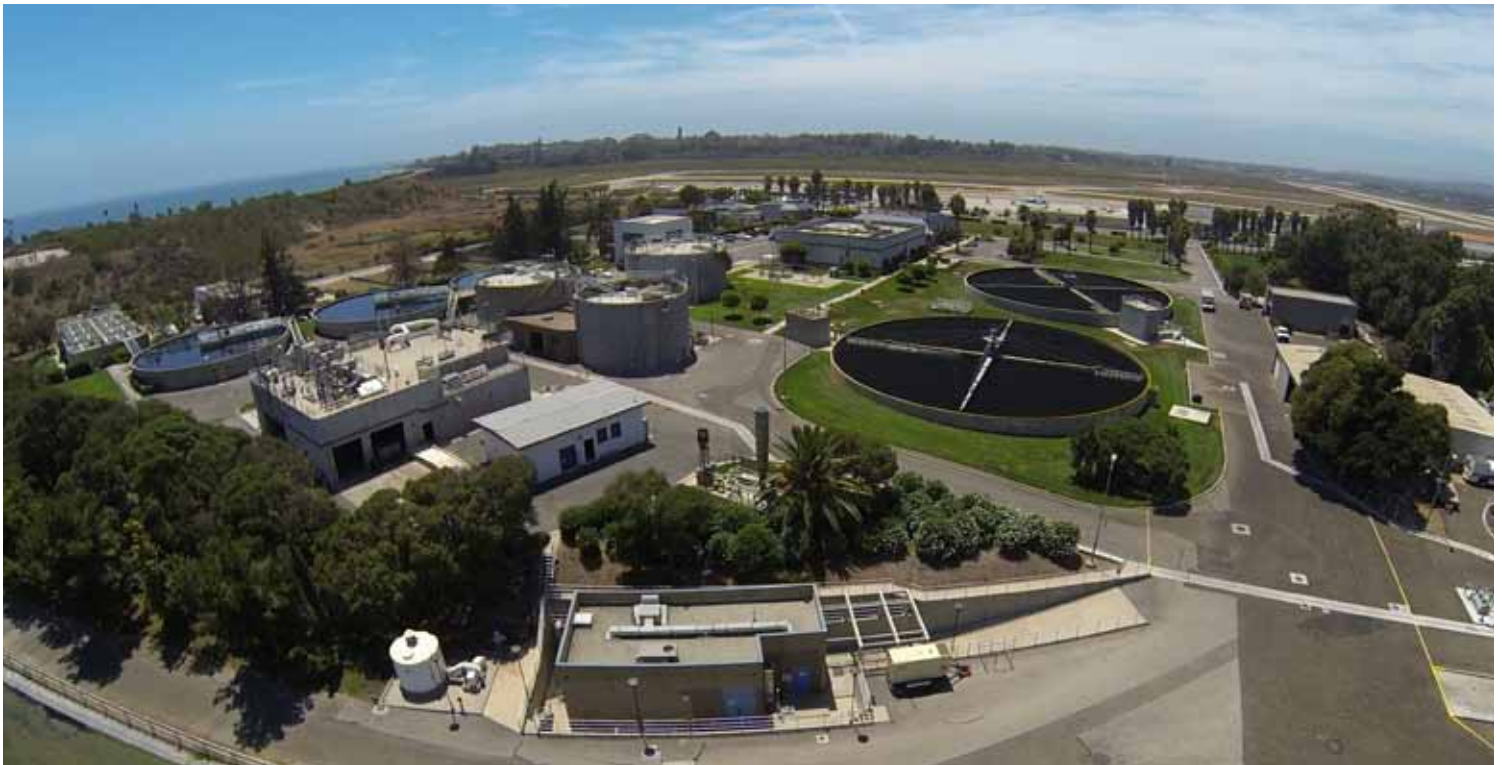
Aerial view of the recently upgraded wastewater treatment plant.

The recently upgraded wastewater treatment plant is purifying the water to a higher level than before, and producing more valuable recycled products.