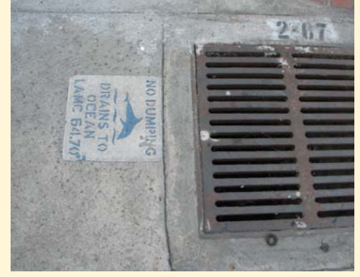
STORM DRAINS collect runoff and stormwater from streets, and discharge it untreated into the ocean.