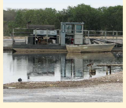
One of the hidden energy efficiency improvements of the treatment plant upgrade program will be the replacement of the current diesel dredge with a more efficient, cleaner electric operation.

Higher Level of Treatment. Although the current treatment process fully protects public health and the environment, and complies with all current standards, the upgrade will raise the level of treatment and also meet future, more stringent requirements.