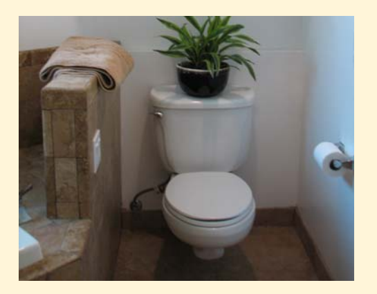
PRIVATE LATERALS connect a home or business to the public sanitary sewers.

PUBLIC SANITARY SEWERS collect household and business sewage, deliver it to a wastewater plant for treatment. Once clean, it is then safely discharged to the ocean or treated to an even higher level for use as recycled water.