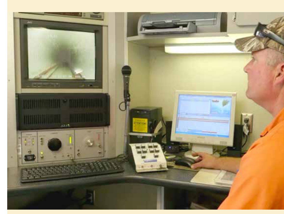
Inside the video truck a special video camera crawls through the entire pipeline system, helping to evaluate maintenance needs.

THE DISTRICT'S HIGHLY TRAINED AND EFFICIENT EMPLOYEES FOCUS ALL THEIR ATTENTION ON PROVIDING A SINGLE SERVICE WITH EXCELLENCE AND COST-EFFICIENCY.