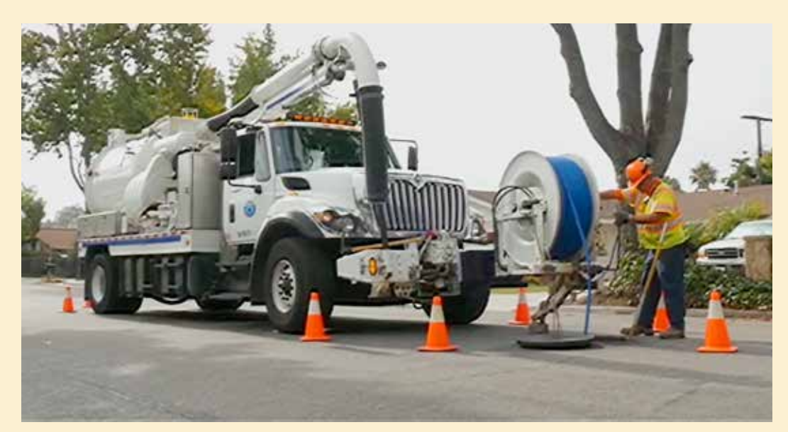
District crews systematically jet wash and vacuum clean the sewer system, cut out roots and undertake other needed maintenance.