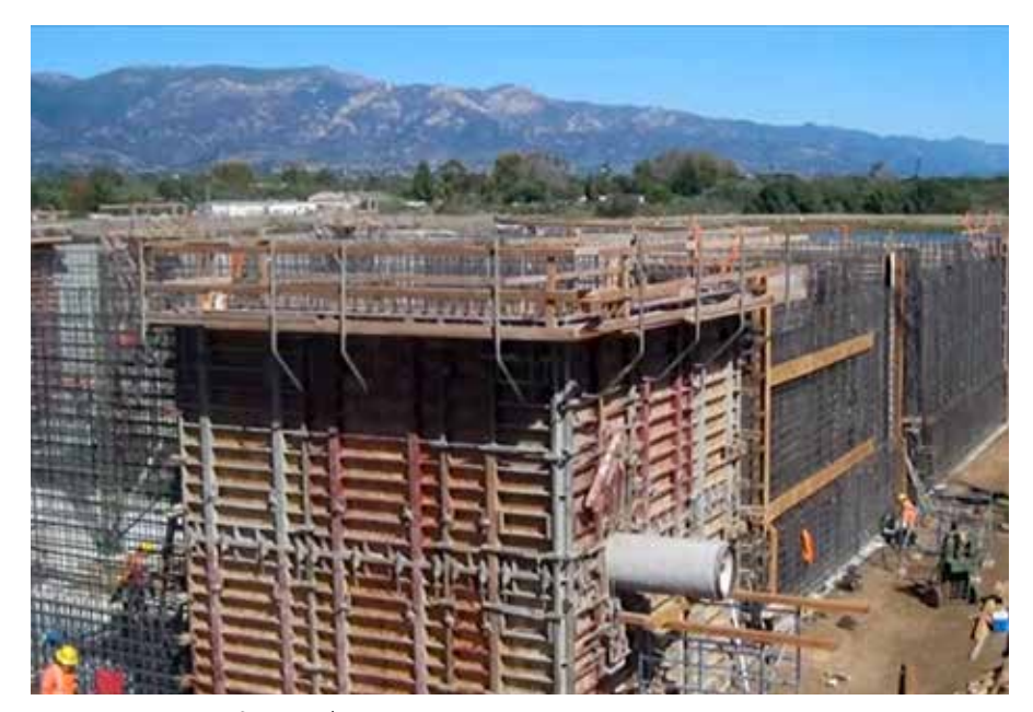
The District paid for the $40 Million Dollar plant upgrade as it was constructed, avoiding costly borrowing and interest costs.

GOLETA SANITARY DISTRICT 2015-16: $36.51 COUNTY AVERAGE 2015-16: $57.88