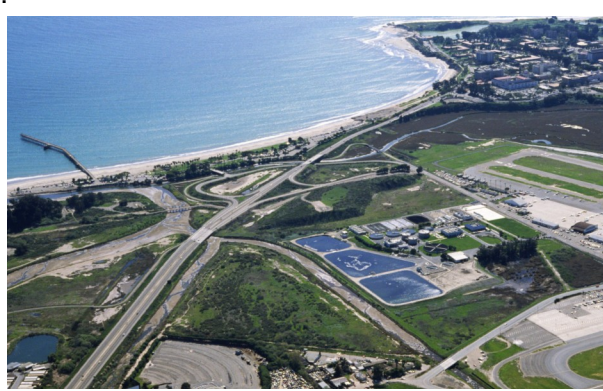
Goleta Sanitary District's regional wastewater facility treats all the wastewater from the Goleta Valley. The clean and disinfected water is either recycled back to the community as reclaimed water for landscaping or is discharged to the Pacific Ocean.

As you travel along William Moffet Place on your way to Goleta Beach or the airport you will see large construction equipment mobilizing on the wastewater treatment plant site.