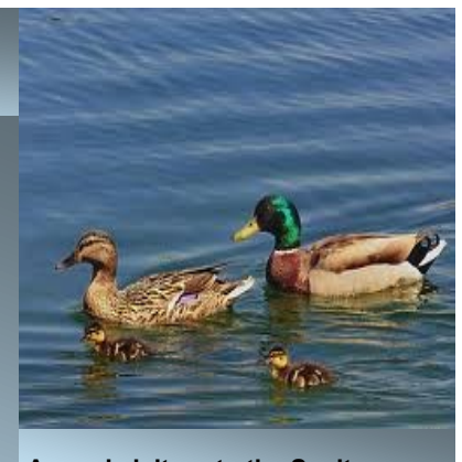
Annual visitors to the Sanitary District treatment ponds.

Please call the District at (805) 967-4519 if you have any questions.