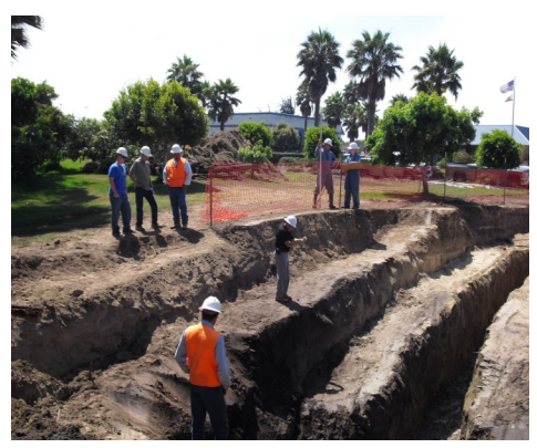
Trenching needed to satisfy requirements of a fault study for the wastewater treatment plant upgrade project. No fault lines were found clearing the way for construction on-site.

A phase 1 archaeological study was required by Santa Barbara County Planning & Development in addition to a previously completed geo-probe study to confirm that no historical artifacts would be disturbed in the proposed construction areas. As expected, no artifacts were found.